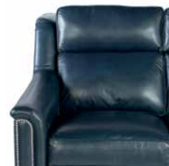
2 Piece Back (Add -2 to end of style #)