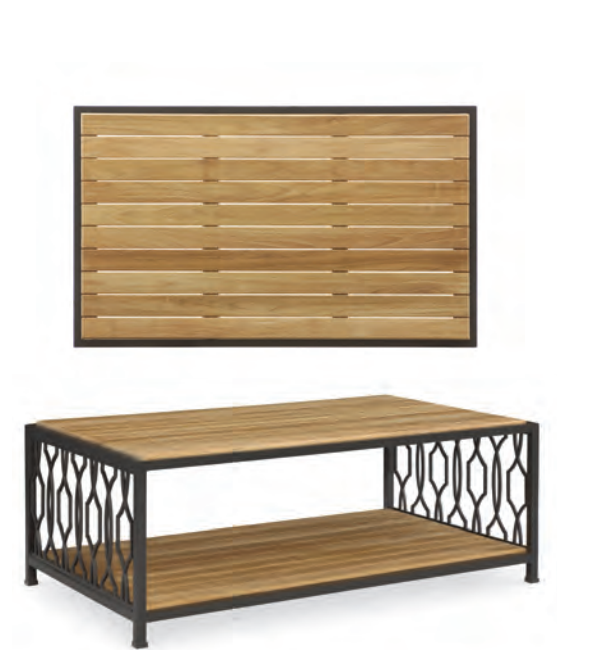
D36-86 Palladian Cocktail Table W 50 D 30 H 18.5 Natural Teak with Powder Coated Aluminum Soft Iron frame finish