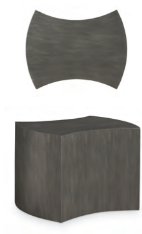
D36-83S Crescent Bunching Cocktail Table W 24 D 19 H 18 Retreat Steel finish Powder Coated Aluminum