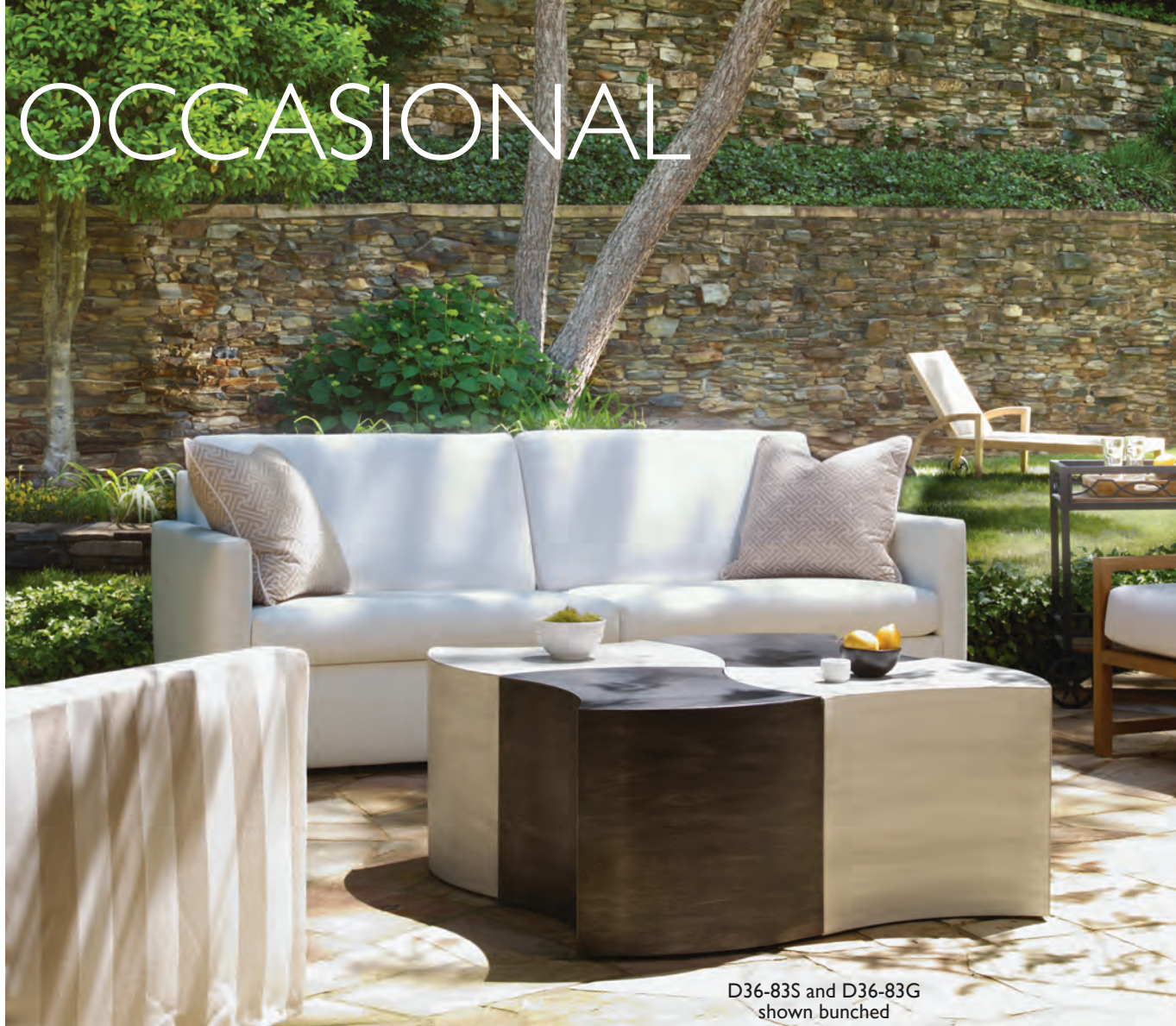
D36-83S and D36-83G shown bunched