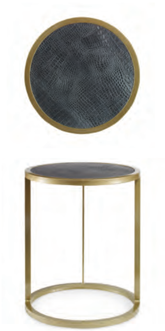
D36-84C Halo Accent Table with Croc Insert W 20 D 20 H 24 Antique Brass finish | Powder Coated Aluminum Textured cast composite top