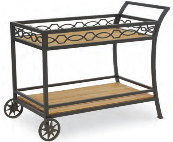
D36-89 Palladian Drink Cart