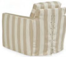
Back view of Slipcover