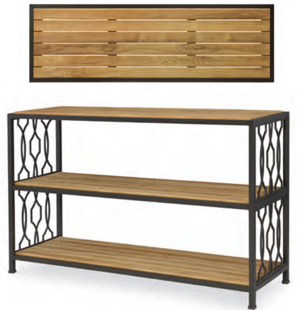
D36-87 Palladian Console Table W 56 D 18 H 34.75 Natural Teak with Powder Coated Aluminum Soft Iron frame finish