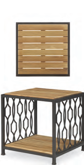
D36-82 Palladian Side Table W 24 D 24 H 24.5 Natural Teak with Powder Coated Aluminum Soft Iron frame finish