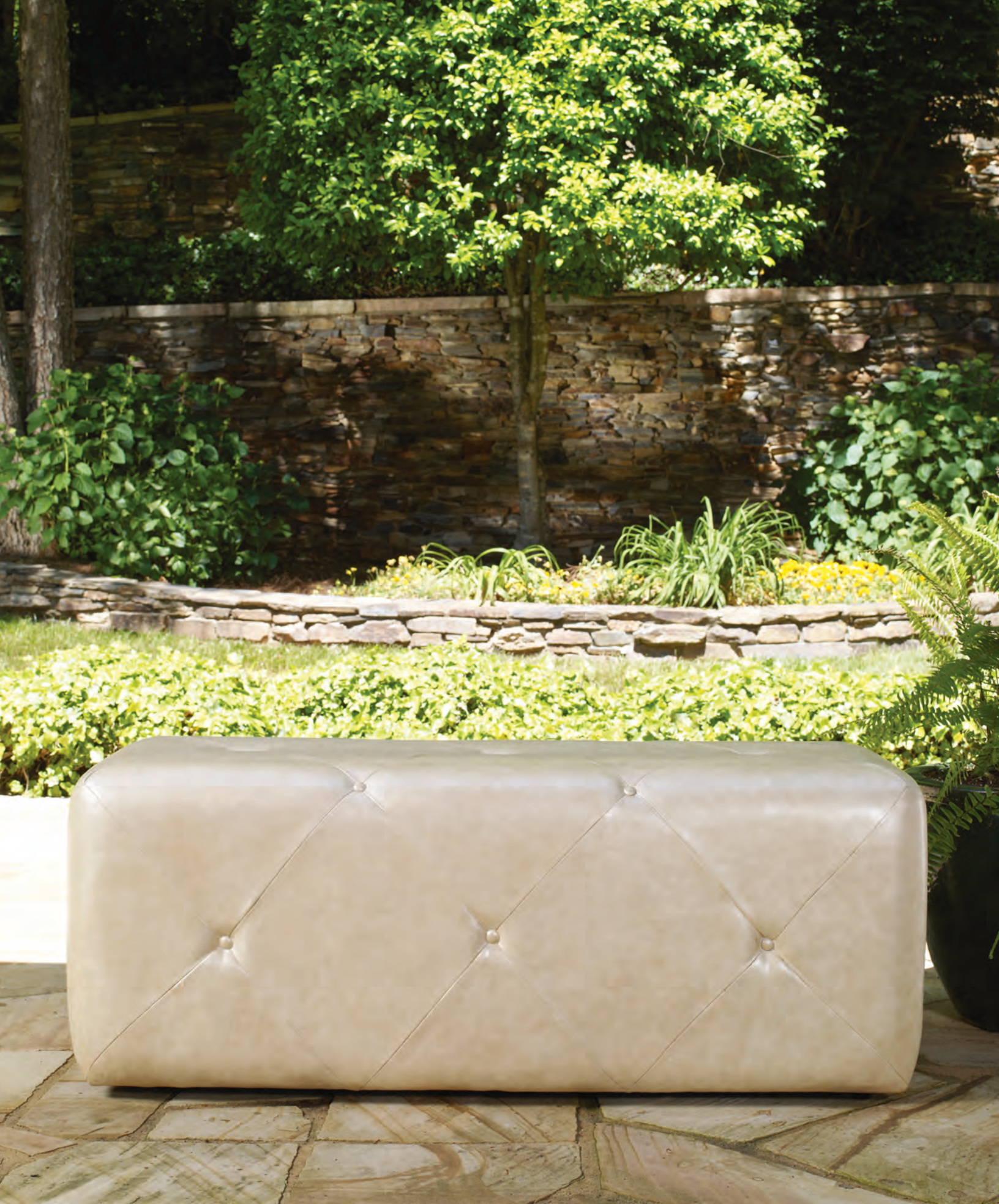
Shown above: D36-46 Trove Bench