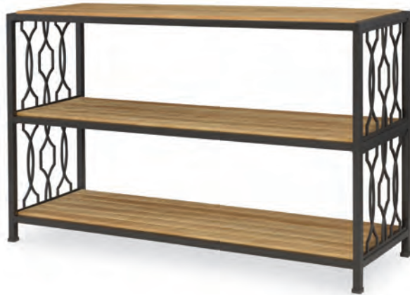
D36-87 Palladian Console Table