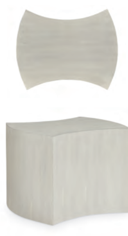
D36-83G Crescent Bunching Cocktail Table W 24 D 19 H 18 Adrift Glint finish Powder Coated Aluminum