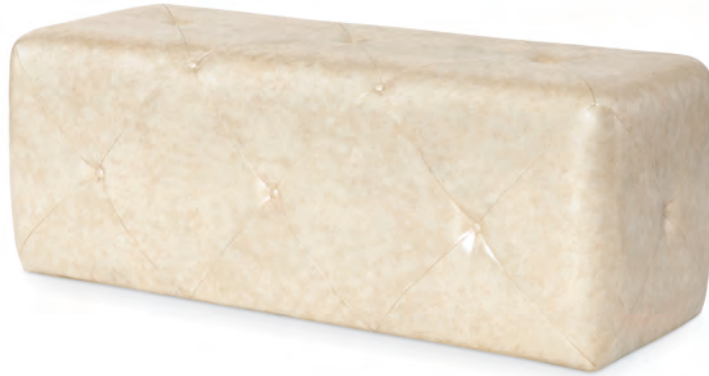
D36-46 Trove Bench W 49 D 19 H 19 Sandstone Pearlized frame finish Cast composite