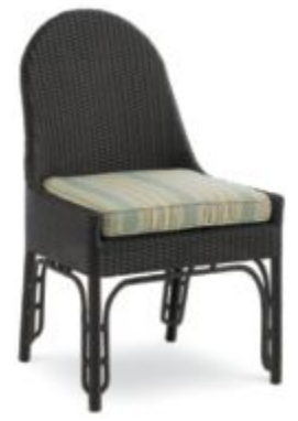
D31-53 Tidewater Dining Chair W 22.5 D 25 H 38.5 All Weather Resin