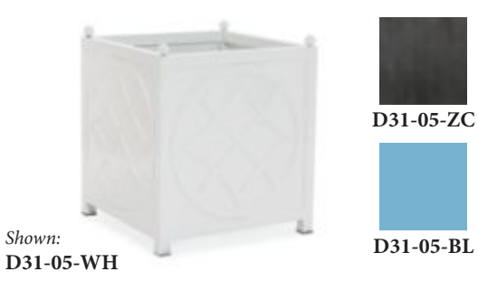
D31-05 Litchfield Planter W 24 D 24 H 27.5 Cast Aluminum | Also availabe in Zinc and Blue finishes