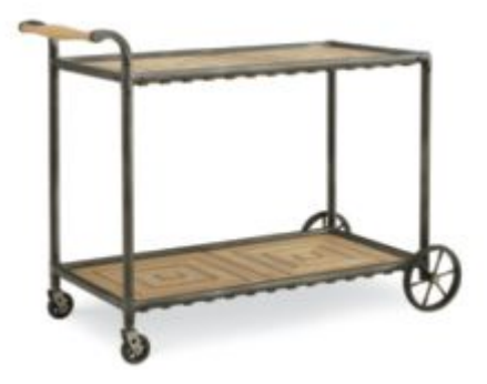
D31-89 Litchfield Drink Cart W 41 D 23 H 34 Natural Teak with Metal Accent