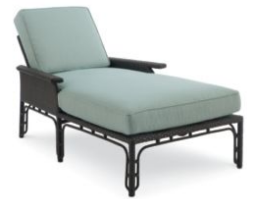
D31-70 Tidewater Chaise W 34 D 59 H 36 Reclined Position: W 34 D 70 H 19.5 All Weather Resin