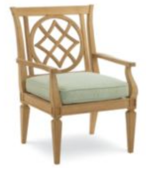
D31-14 Litchfield Garden Chair W 25 D 25 H 35 Natural Teak

D31-46 Litchfield Garden Bench W 75 D 25 H 36 Natural Teak