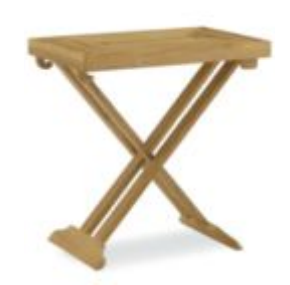
D31-87 Litchfield Tray Table W 26 D 16 H 26.5 Natural Teak