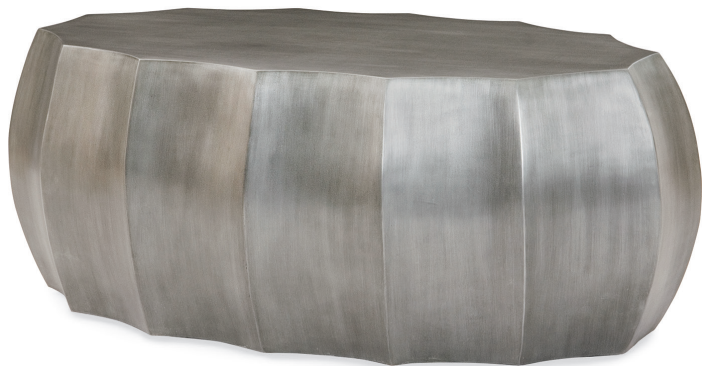
D89-5500-AZ Cocktail Table W 47 D 26 H 19.5 Finish Antique Zinc Available only as shown