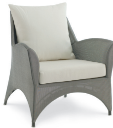
Shown in 17000-11