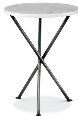
D89-5210-AP 18" Round Occasional Table W 18 D 18 H 24 Frame finish Antique Pewter Carrara Stone top