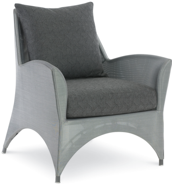
D32-12-9 Lounge Chair W 32 D 31.5 H 36 Inside: W 24 D 19.5 H 17.5 Seat H 18.5 | Arm H 26 Frame finish Titanium