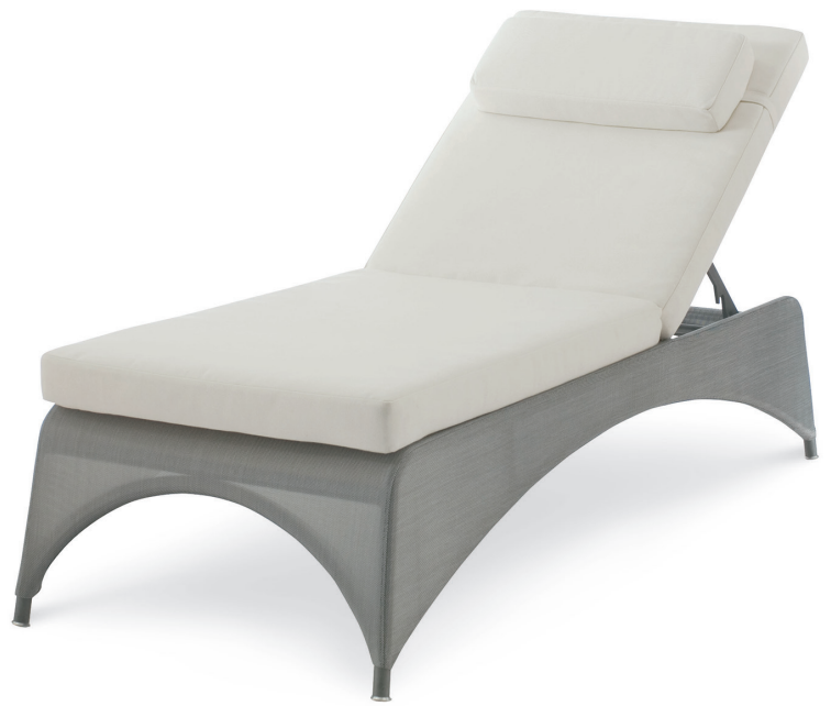
D32-70-9 Chaise Lounge (shown left) D32-70-9 Chaise Lounge (shown right) W 28 D 68 H 39.5 Inside: W 28 D 38.5 H 22 Seat H 17.5 Frame finish Titanium