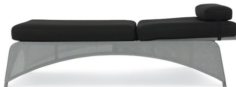
Shown fully reclined | D 71 | Seat H 17.5