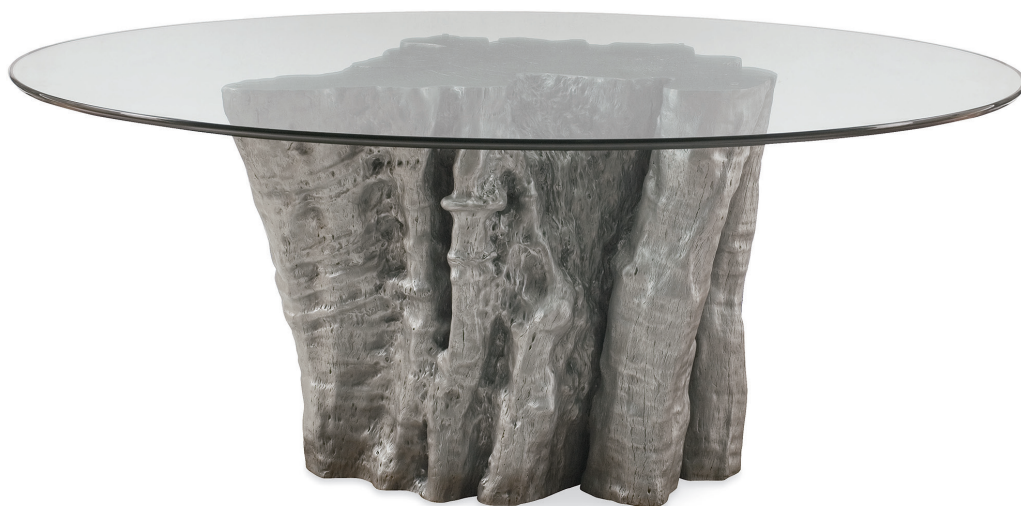
D89-5498-AZ Dining Table Base W 43.5 D 37.5 H 30 Finish Antique Zinc Available only as shown Glass not included