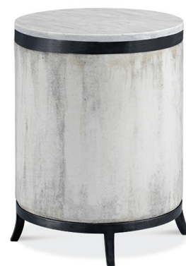
D89-3101-AW 18.25" Round Side Table W 18.25 D 18.25 H 22 Frame finish Antique Pewter Cast GRC with Carrara Stone top