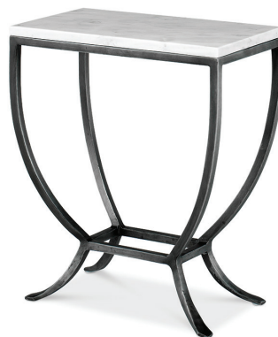
D89-5226-AP 18" Rectangular Side Table W 18 D 10 H 22 Frame finish Antique Pewter Carrara Stone top