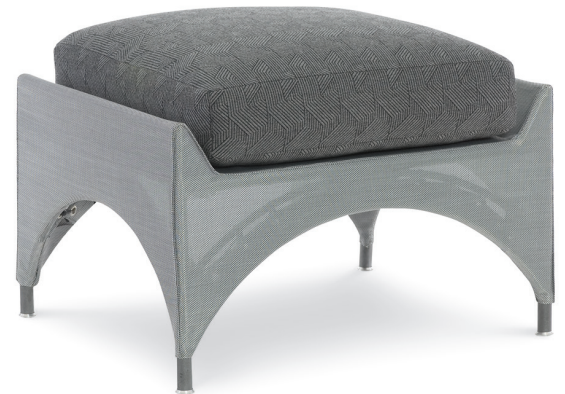
D32-31-9 Ottoman W 26.5 D 21 H 16.5 Inside: W 21 D 21 Seat H 16.5 Frame finish Titanium