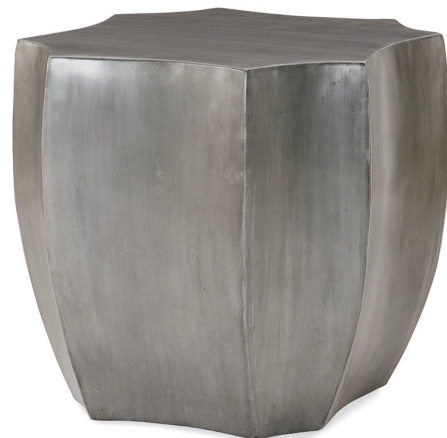
D89-5501-AZ Lamp Table W 25 D 25 H 25.5 Finish Antique Zinc Available only as shown