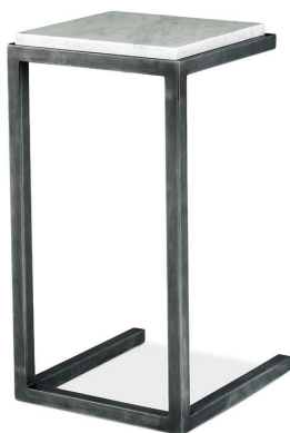
D89-5232-AP 12.75" Rectangular Side Table W 12.75 D 14.75 H 24.25 Frame finish Antique Pewter Carrara Stone top