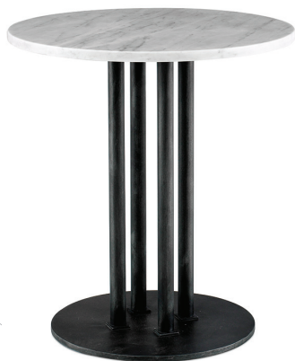
D89-3100-AP 22" Round Occasional Table W 22 D 22 H 24 Frame finish Antique Pewter Carrara Stone top