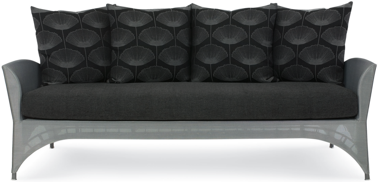
D32-22-9 Sofa W 80 D 31.5 H 36 Inside: W 72 D 19.5 H 17.5 Seat H 18.5 H | Arm H 26 Frame finish Titanium