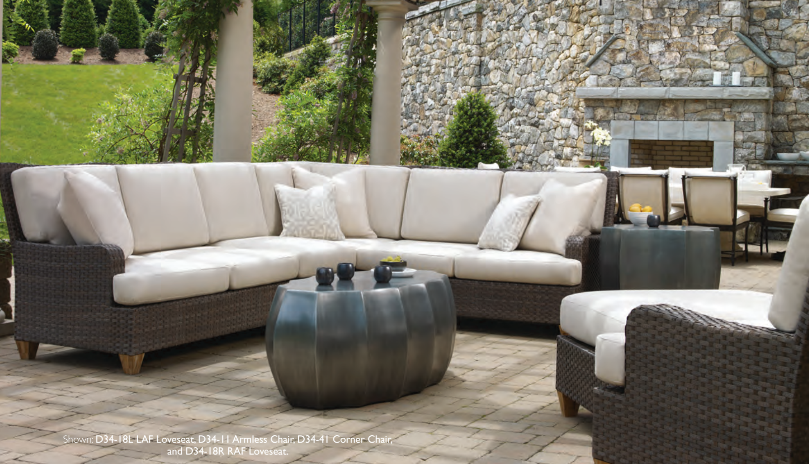
Shown: D34-18L LAF Loveseat, D34-11 Armless Chair, D34-41 Corner Chair, and D34-18R RAF Loveseat.