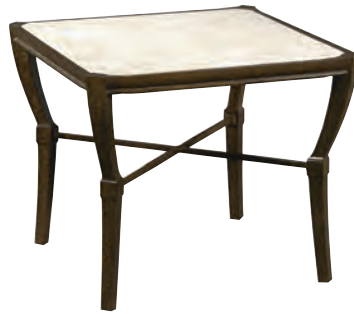
D12-85-1 Side Table Andalusia Collection W 24 D 24 H 20 Powder Coated Aluminum Frame finish Cordoba

Custom frame finishes available D12-83-9