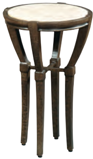
D12-83-1 Occasional Table Andalusia Collection W 14 D 14 H 23 Powder Coated Aluminum Frame finish Cordoba

Custom frame finishes available D12-83-9