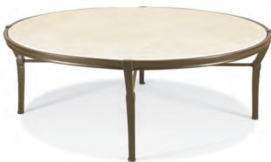
D12-88-1 50" Round Cocktail Table Andalusia Collection W 50 D 50 H 17 Powder Coated Aluminum Frame finish Cordoba

Custom frame finishes available D12-86-9