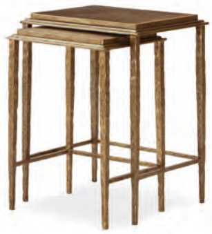
D89-5152-BR Nesting Table (Set of 2) Leisure Complements W 20 D 16 H 26 Antique Bronze Available only as shown