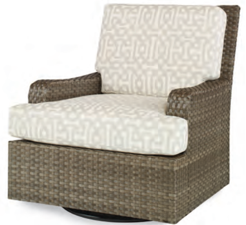
D34-16 Swivel Lounge Chair Dunes Collection W 33 D 38 H 37 Inside: W 24.5 D 24.5 H 18 Seat H 19 | Arm H 23 All Weather Resin Frame finish Stone Brown