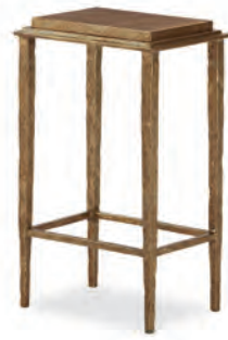
D89-5153-AB Chairside Table Leisure Complements W 13.5 D 10 H 23 Antique Bronze Available only as shown