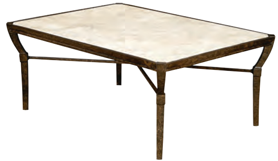
D12-86-1 Cocktail Table Andalusia Collection W 42 D 30 H 17 Powder Coated Aluminum Frame finish Cordoba

Custom frame finishes available D12-85-9