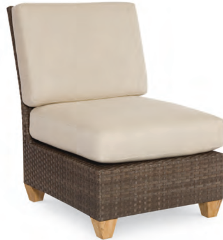
D34-11 Armless Chair Dunes Collection W 33 D 38 H 38 Inside: W 33 D 24.5 H 19 Seat H 19 All Weather Resin Frame finish Stone Brown