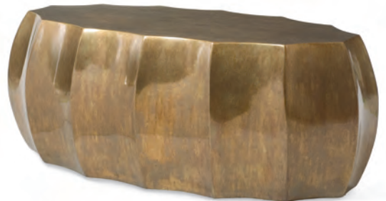
D89-5475-AB Cocktail Table Leisure Complements W 47 D 26 H 19.5 Antique Brass Available only as shown