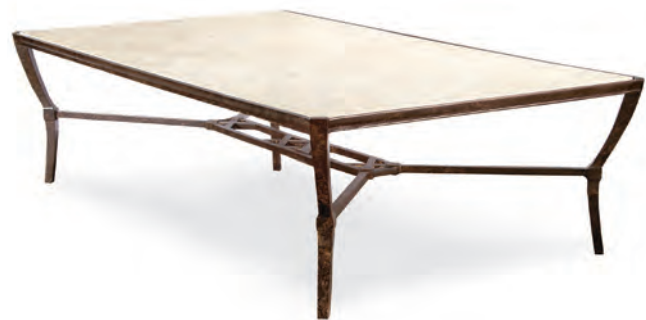
D12-89-1 72" Rectangular Cocktail Table Andalusia Collection W 72 D 44 H 17 Powder Coated Aluminum Frame finish Cordoba

Custom frame finishes available D12-88-9