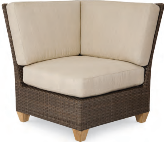
D34-41 Corner Chair Dunes Collection W 38 D 38 H 38 Inside: W 38 D 24.5 H 19 Seat H 19 All Weather Resin Frame finish Stone Brown