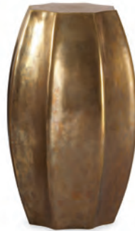
D89-5036-AB 16" Chairside Table Leisure Complements W 16 D 16 H 27 Antique Brass Available only as shown