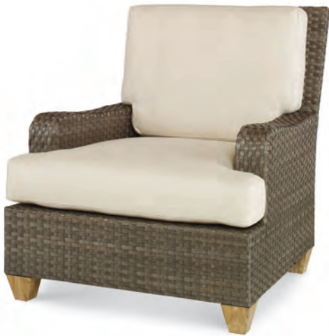
D34-12 Lounge Chair Dunes Collection W 33 D 38 H 37 Inside: W 24.5 D 24.5 H 18 Seat H 19 | Arm H 23 All Weather Resin Frame finish Stone Brown