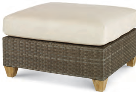
D34-31 Ottoman Dunes Collection W 33 D 30.5 H 19 Seat H 19 All Weather Resin Frame finish Stone Brown